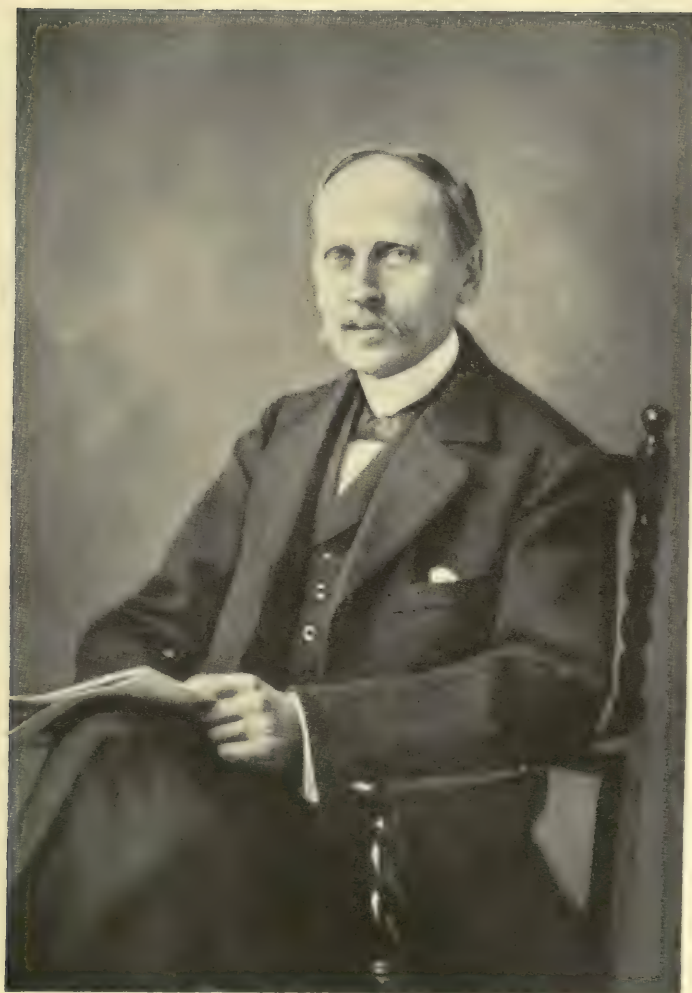
Romain Rolland at the time of writing Above the Battle